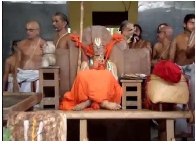
AcArya's carama tirumeni at Srlrangam